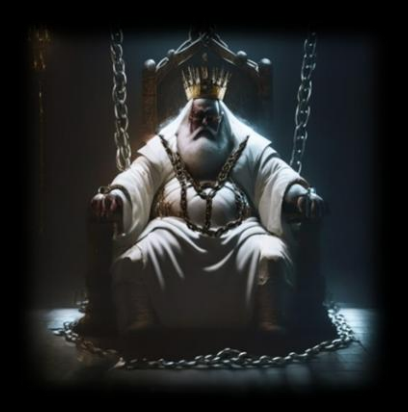
Linus (the pope of the church)