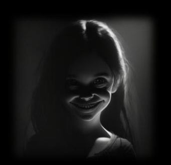
Abiosis when she was young